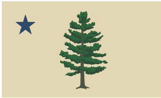
proposed new flag

The proposed law would also repeal requirements that the flag and staff be of certain dimensions and include a fringe and tasseled cord.