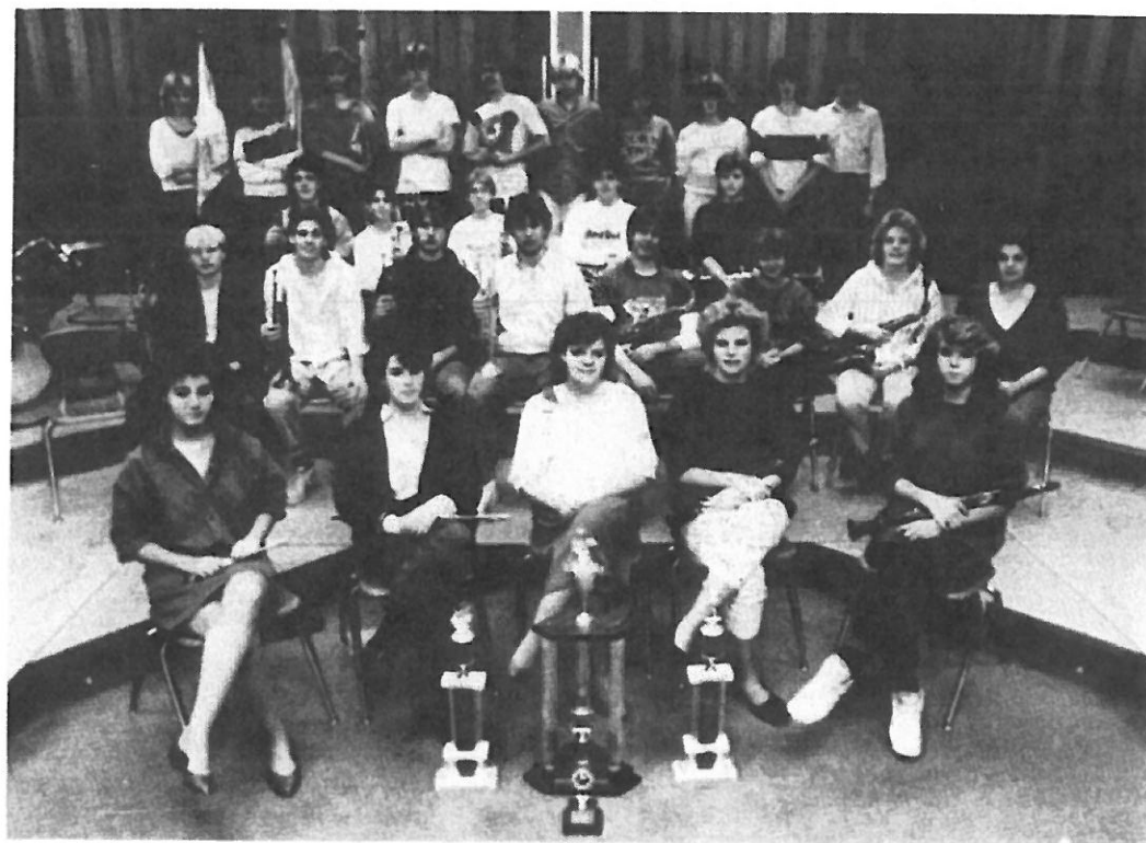
Award Winning Band