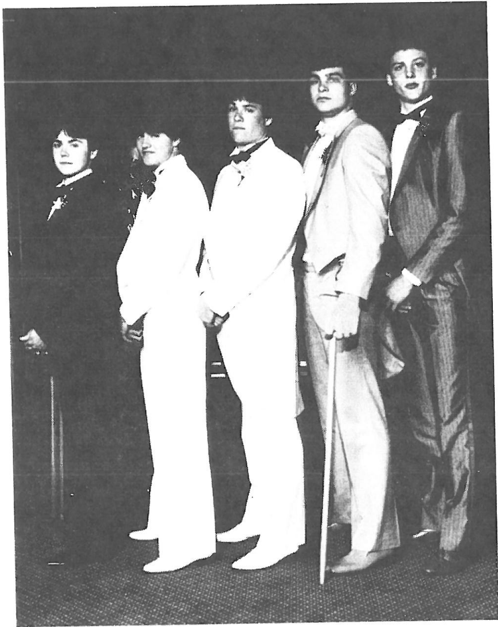
Steppin' Out with a Champ.